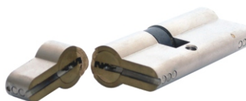
Snapsafe™ Cylinder after attack a thief has snapped the end of the cylinder but the lock is protected and the key still works