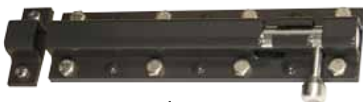
Heavy Duty Tower Bolt: HS923/10 254mm long

Other options are also available, see product selector 700 series on www.exidor.co.uk